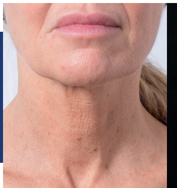
AFTER 2 TREATMENTS